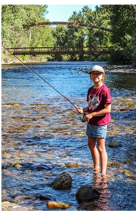
Draper Wood River Preserve, Hailey, ID

Thank you to Wood River Land Trust for sharing their accreditation story. Are you interested in sharing your story with the Commission? Please contact us at <a href="info@landtrustaccreditation.org">info@landtrustaccreditation.org</a>.