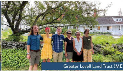
Greater Lovell Land Trust (ME)