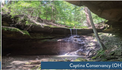
Captina Conservancy (OH)