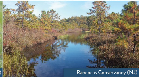
Rancocas Conservancy (NJ)