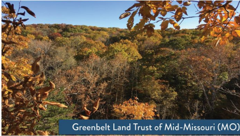
Greenbelt Land Trust of Mid-Missouri (MO)