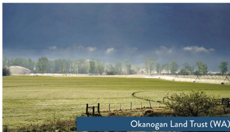
Okanogan Land Trust (WA)