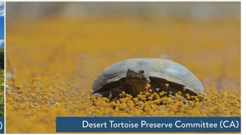
Desert Tortoise Preserve Committee (CA)