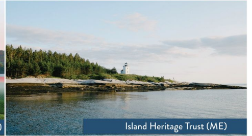
Island Heritage Trust (ME)