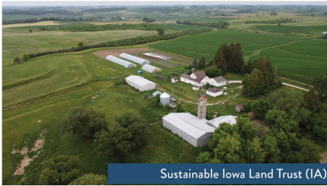
Sustainable Iowa Land Trust (IA)