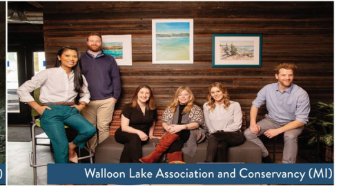
Walloon Lake Association and Conservancy (MI)