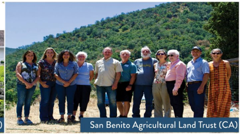
San Benito Agricultural Land Trust (CA)