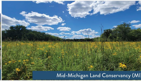
Mid-Michigan Land Conservancy (MI)