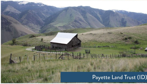
Payette Land Trust (ID)