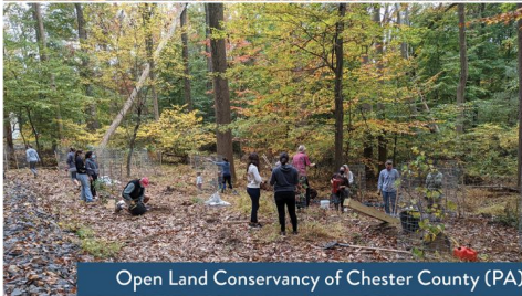
Open Land Conservancy of Chester County (PA)