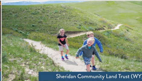
Sheridan Community Land Trust (WY)